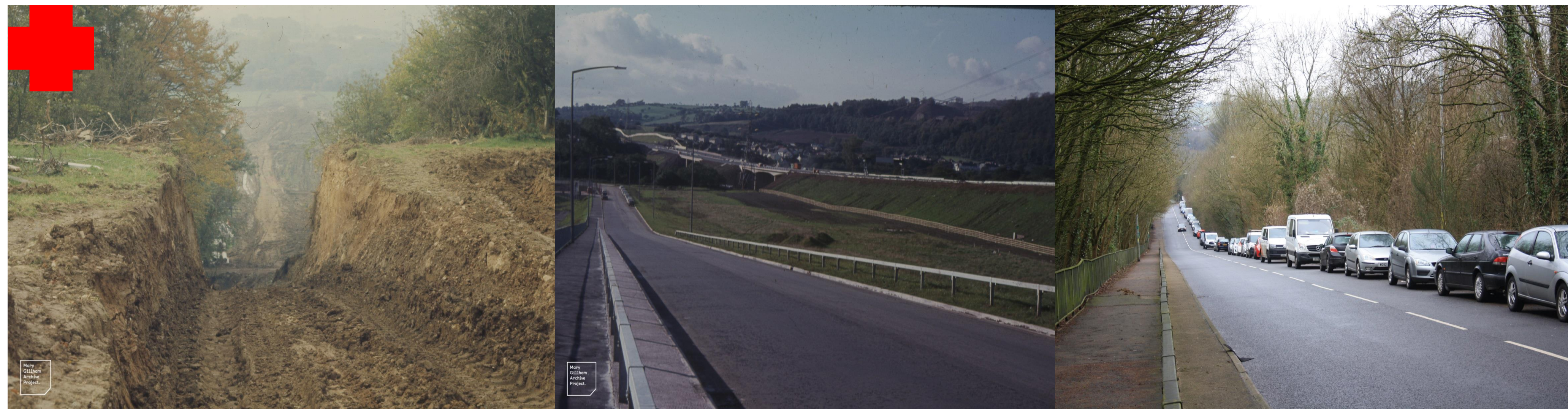
The development of Longwood Drive & M4 in 1973, 1977 & how it looks in 2017