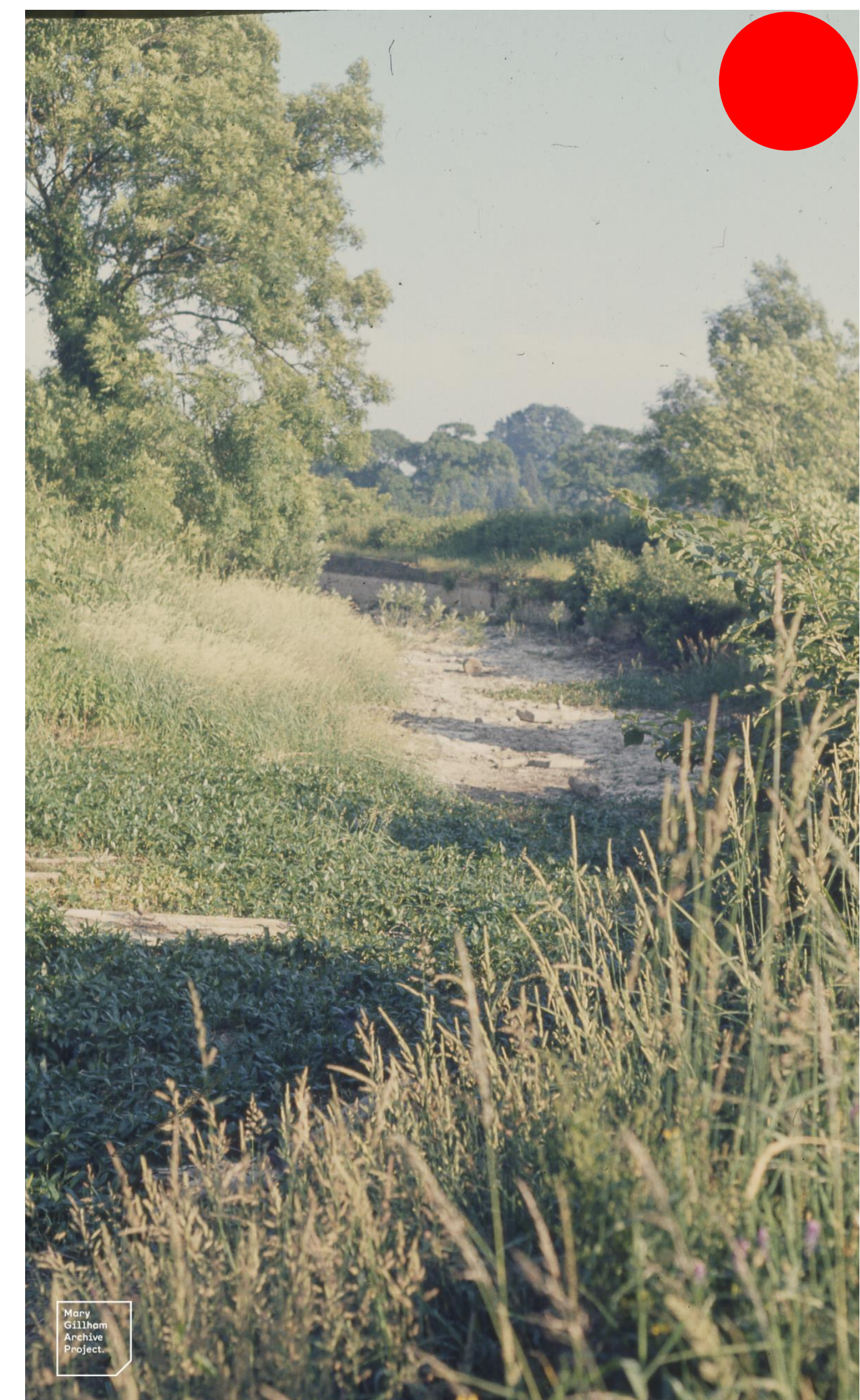
Canal during 1965 drought, before remedial work!