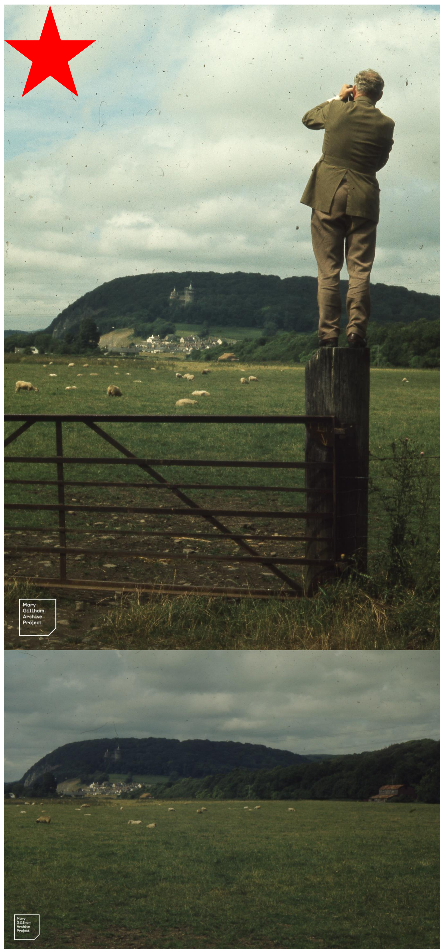
1972, prior to the M4