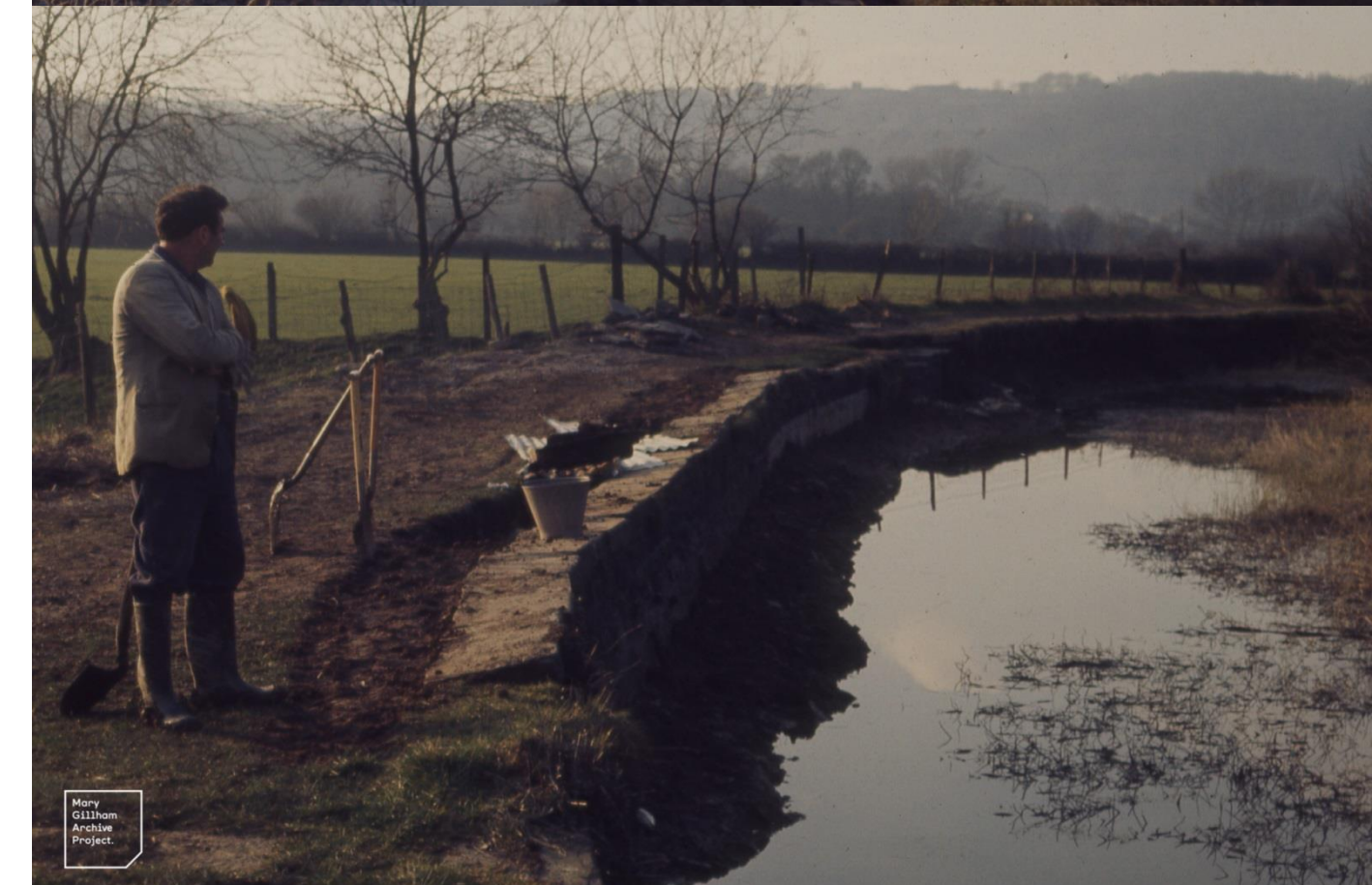
Forest lock repairs in 1972 & the same location in 2017