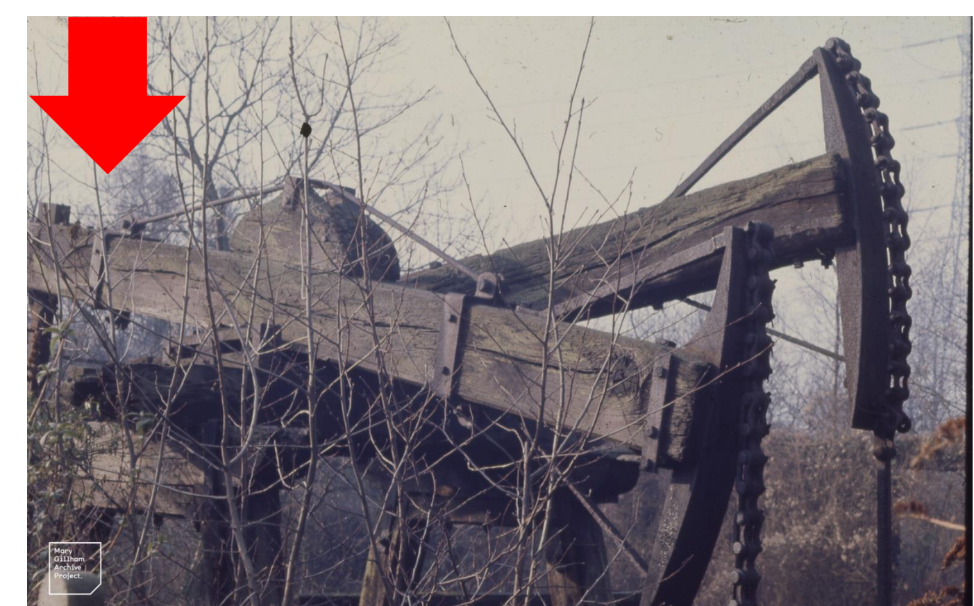
Melingriffith pump in 1972