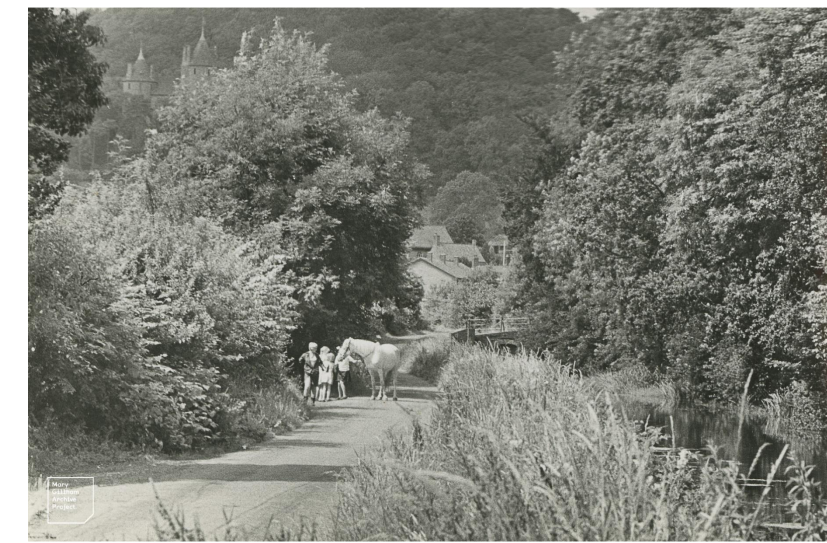
North, pre-M4 & A470, to Castell Coch (above) & Walnut Tree Quarry (right)